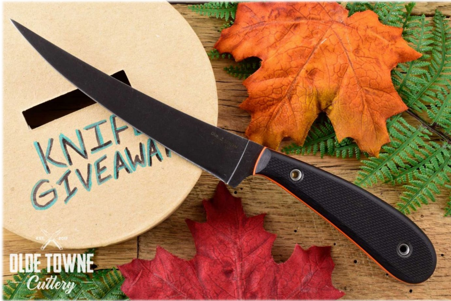
Due South Filet Knife

The Next Winner will be announced on November 15 th !