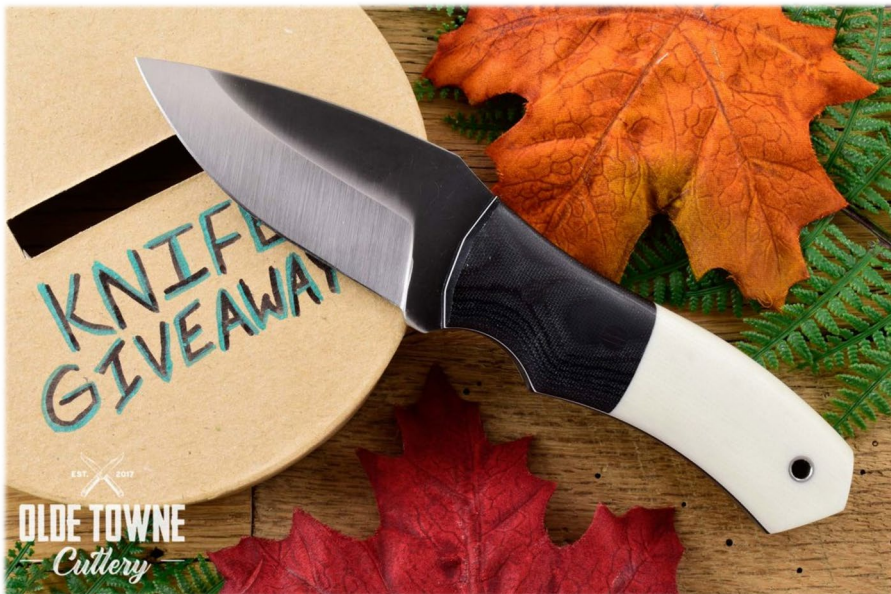
Dragonfly Bladeworks Custom Knives

The Grand Grize Winner will be announced December 13 th !